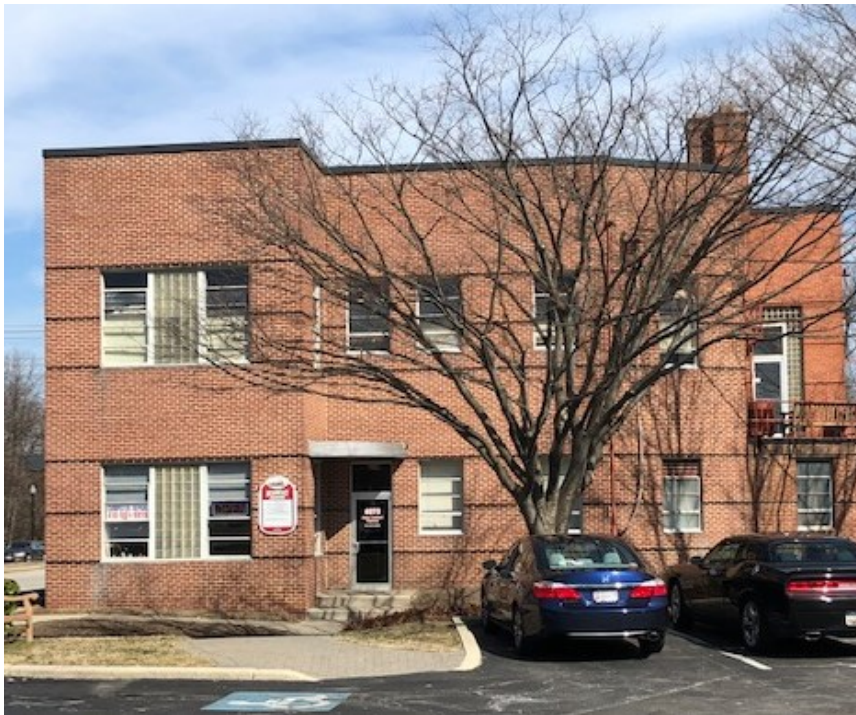
Historic Naval Academy Junction