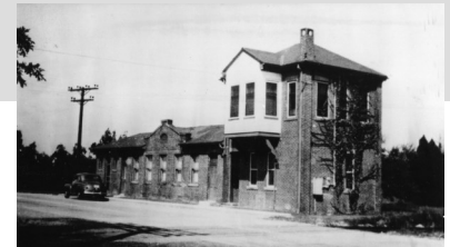
Historic Naval Academy Junction