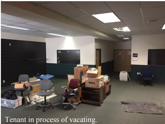
Tenant in process of vacating.

In the rear of Academy Junction Plaza storefronts.