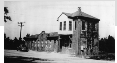
Historic Naval Academy Junction