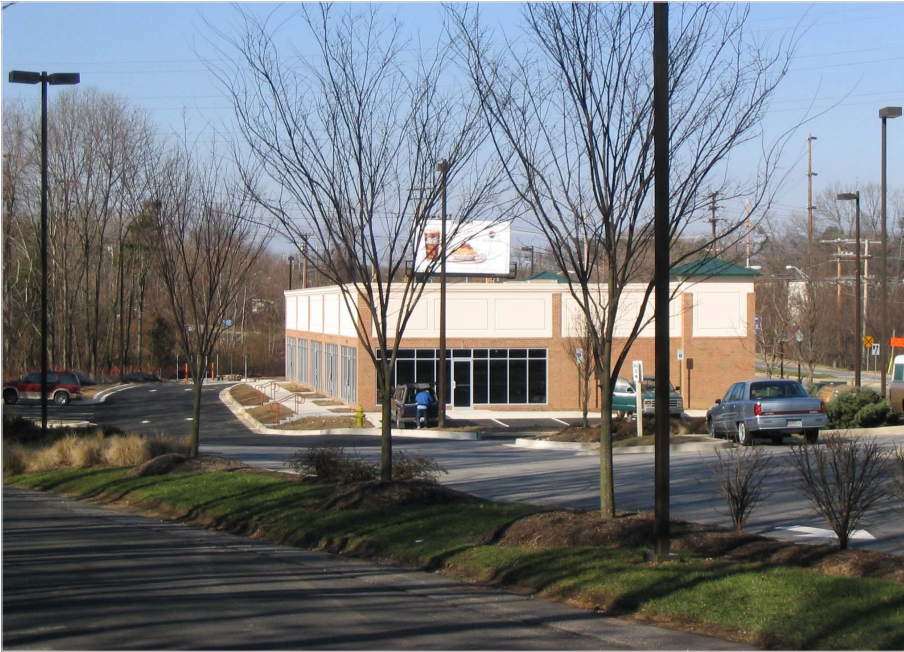
ACADEMY CROSSING IN THE ODENTON TOWN CENTER