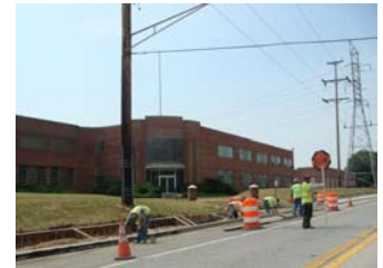
The state spent tax dollars to put in new sidewalks along Route 170 at the old Nevamar Plant. These sidewalks will be ripped out for new development which is currently being planned. Carrot for the attention; stick for the waste.