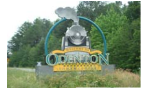
What was once lovely, is now unkempt, ugly & overgrown.