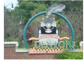
Still no "O" for the Odenton sign.