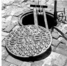
$12.7 mil Sewer project was passed in the County budget. Now beginning Sewer Sub-Service District Legislation. Developers will pay a $1,400+/EDU surcharge (in addition to regular fees) to repay County for fronting the cost.