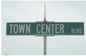
The Morgan Road street sign has been changed to say Town Center Boulevard.